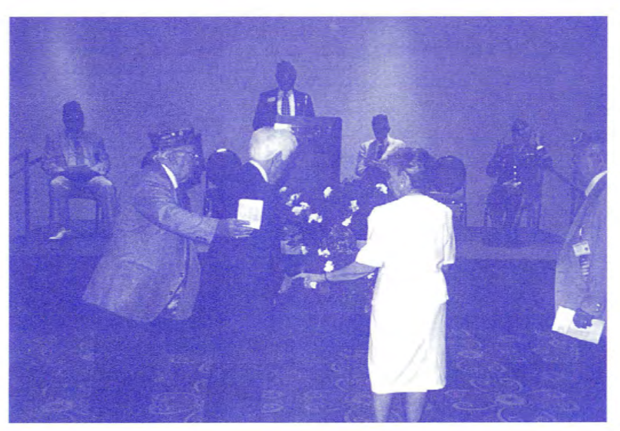
New Orleans Memorial Service. 1996