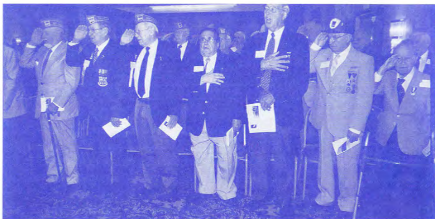
The "Pledge of Allegiance"...