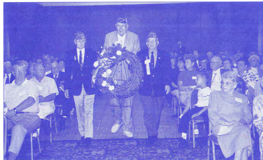
Presentation of the Wreath...