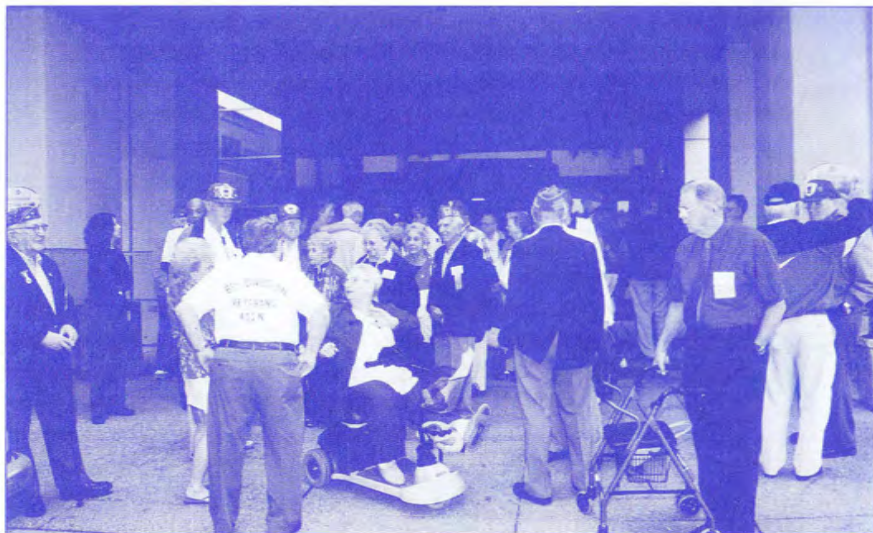
Waiting for the bus...