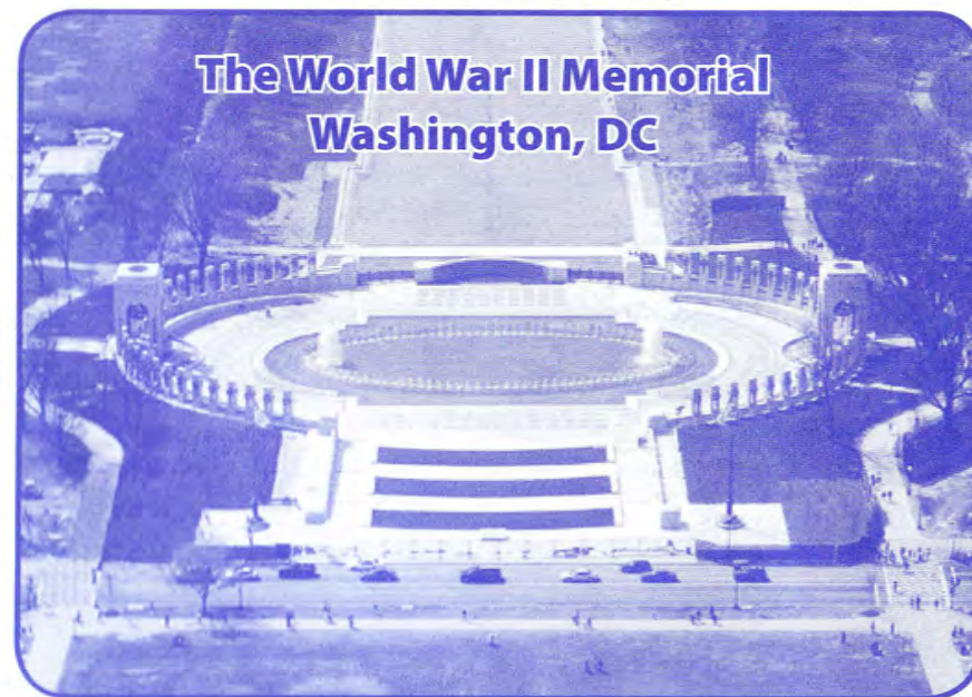
The World War II Memorial Washington, DC

Deadline for the next issue is December 1, 2004