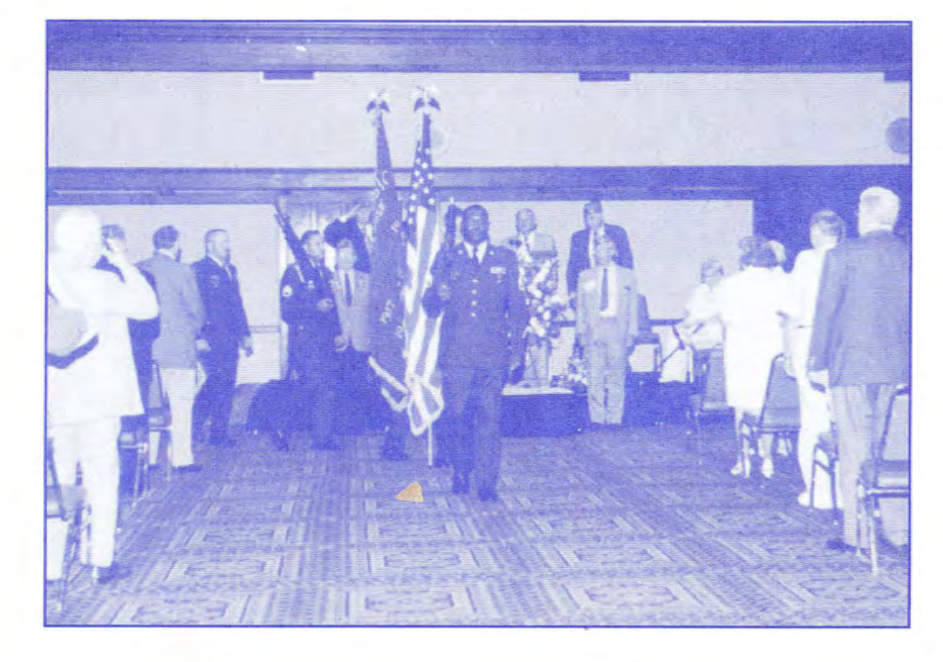
Above: Memorial Service—Color Guard of the U.S. Army Armor Center, Fort Knox, Kentucky