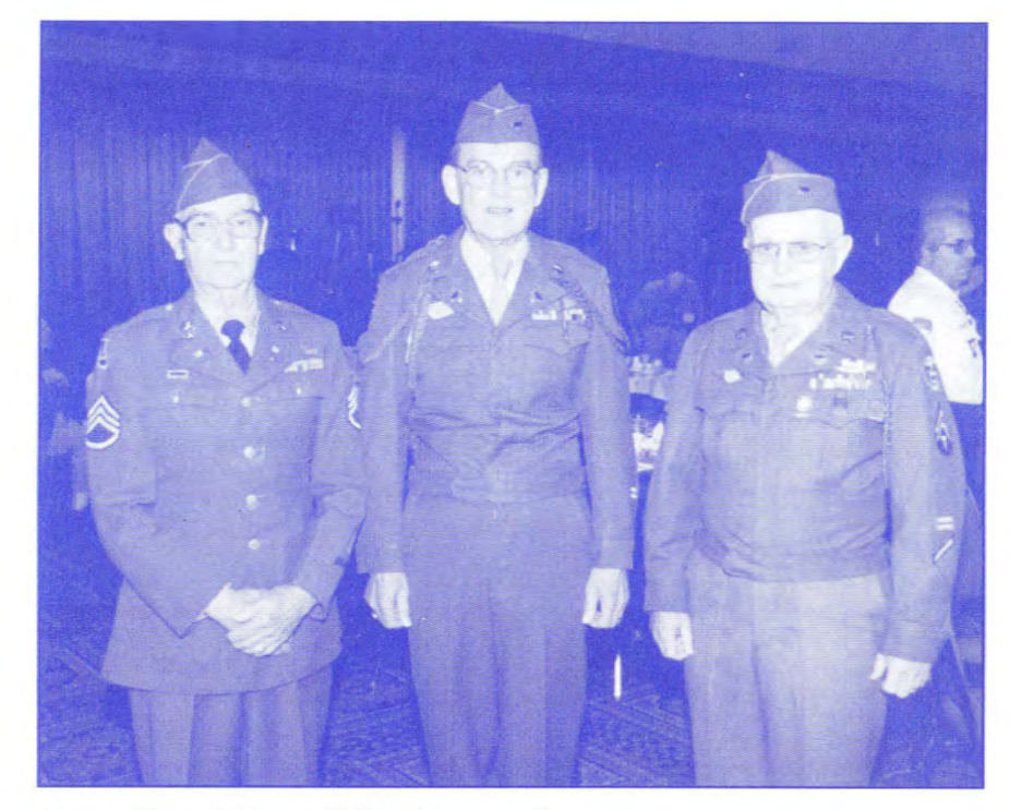
Above: The univorms still fit... does yours?