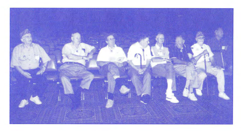
Above: Executive Council meeting on Friday.