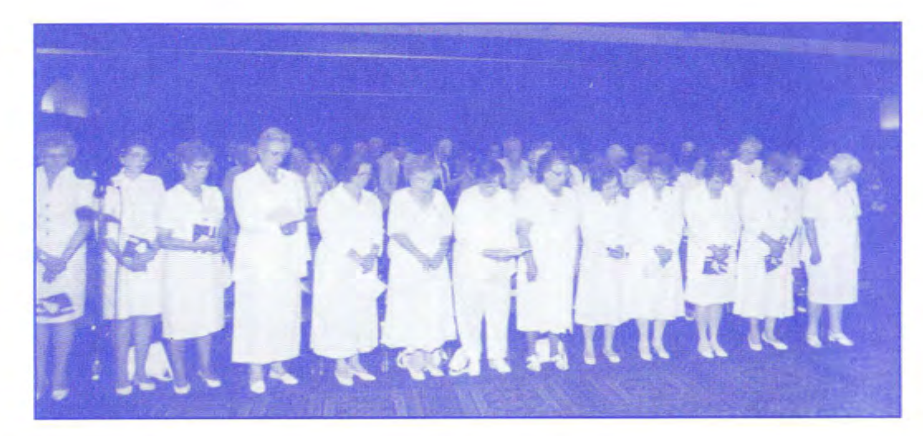
Above: Ladies Auxiliary at the Memorial Service.

Below: National Officers at Memorial Service.