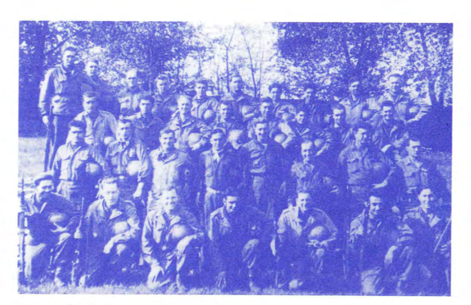
Co. B 317th Infantry, 80 Division / Regensburg, Germany, Aril 1945