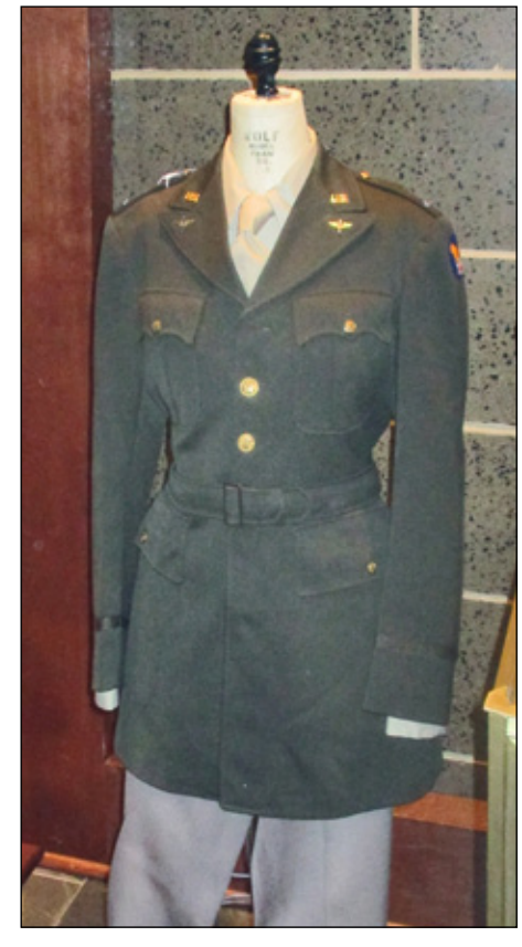
More photos from the Bedford, VA Museum