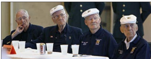
The Doolittle Raiders